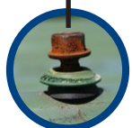
loose or missing fasteners