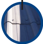
open or lifted seams