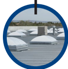
weathered or leaking skylights