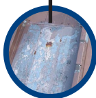
flaking or peeling paint