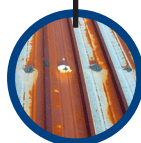
areas of light and heavy rust